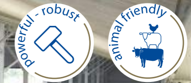
Free Stall Cubicles