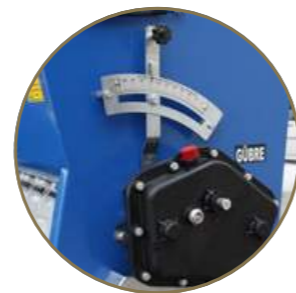
Easy to adjust seeding rate