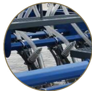
Spring tines offers machine safety