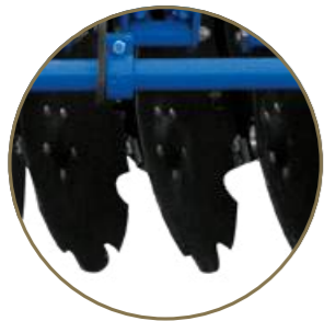
Optimal disc angles to work efficient