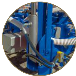
Hydraulic marker as an option