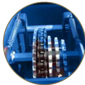
Wide-range adjustable transmission system