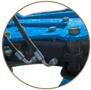
Adjustable working-width as mechanical and hydraulic