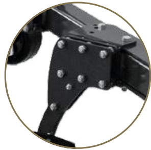
Safety bolt system