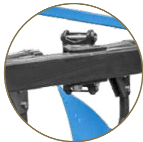
Optimal under-frame clearance