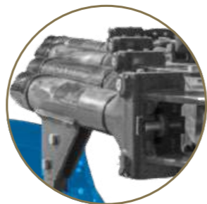
Uninterrupted work with rough conditions