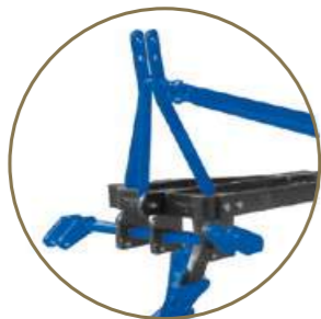
Tractor & plough compatibility