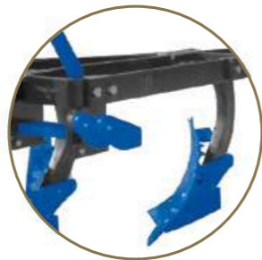
Solid construction superior steel processing